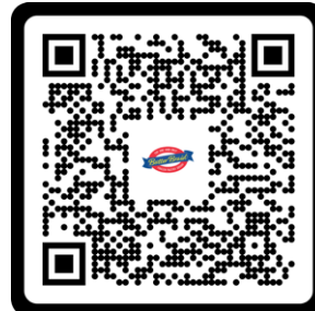
Scan Here Click St. Charles Parish School

Butter Braids are back! Just in time for your Easter celebrations, the St. Charles Home & School Association presents our most delicious fundraiser. Purchase your Butter Braids and Wooden Spoon Cookie dough through March 19th. Pastry & cookie dough pick up will be on Thursday, March 30th from 4:30-6:00pm at the West Gym entrance (orders must be picked up that day).