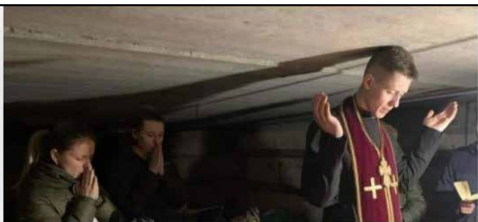
A Ukrainian Greek Catholic priest celebrates Liturgy for evacuees in a bomb shelter, late February 2022