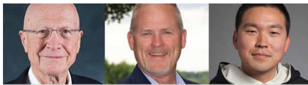
Dr. Peter Kreeft

You're invited to join the 2022 Men of Christ conference – Reawakening The Catholic Man – which will be held in parishes across the Archdiocese of Milwaukee, including our parish. The morning will feature well-known speakers, Mass, Adoration, Confession and fellowship.