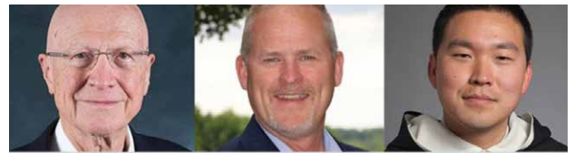
Dr. Peter Kreeft

You're invited to join the 2022 Men of Christ conference – Reawakening The Catholic Man – which will be held in parishes across the Archdiocese of Milwaukee, including our parish. The morning will feature well-known speakers, Mass, Adoration, Confession and fellowship.