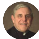
ARCHBISHOP JEROME LISTECKI Archbishop of Milwaukee

Please note: Masks are optional. Social distancing is not guaranteed at the conference.