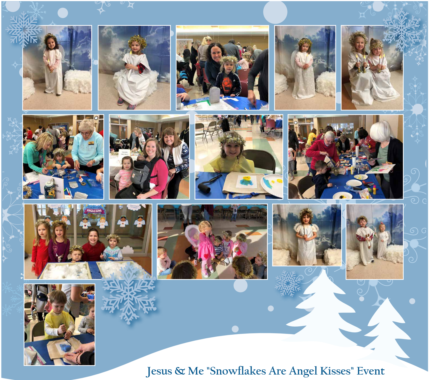
Jesus & Me "Snowflakes Are Angel Kisses" Event held Feb. 13th

February 24, 2019 SEVENTH SUNDAY IN ORDINARY TIME