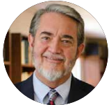
DR. SCOTT HAHN Best-selling author & theologian