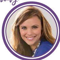
LEAH DARROW Convert & former model